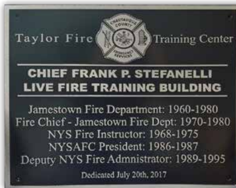
The plaque that will be hung on the new burn building at the training center in Jamestown.